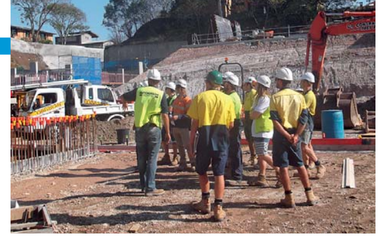
Regular Friday afternoon site visits were an invaluable aspect of the Future Leaders Program training last year.

set-out, structures, programming, planning and problem-solving; a low-set multi-unit residential development; and a medium-rise multi-unit development where considerations for the future staging of works was critical to the outcome.