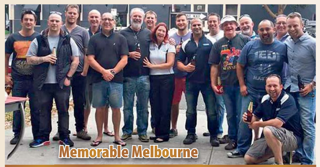
The Melbourne team made their end of year a memorable one – starting with a BBQ on the last day of work with prize giveaways and a raffle draw and then kicking on with some evening shenanigans at European Bier Cafe.