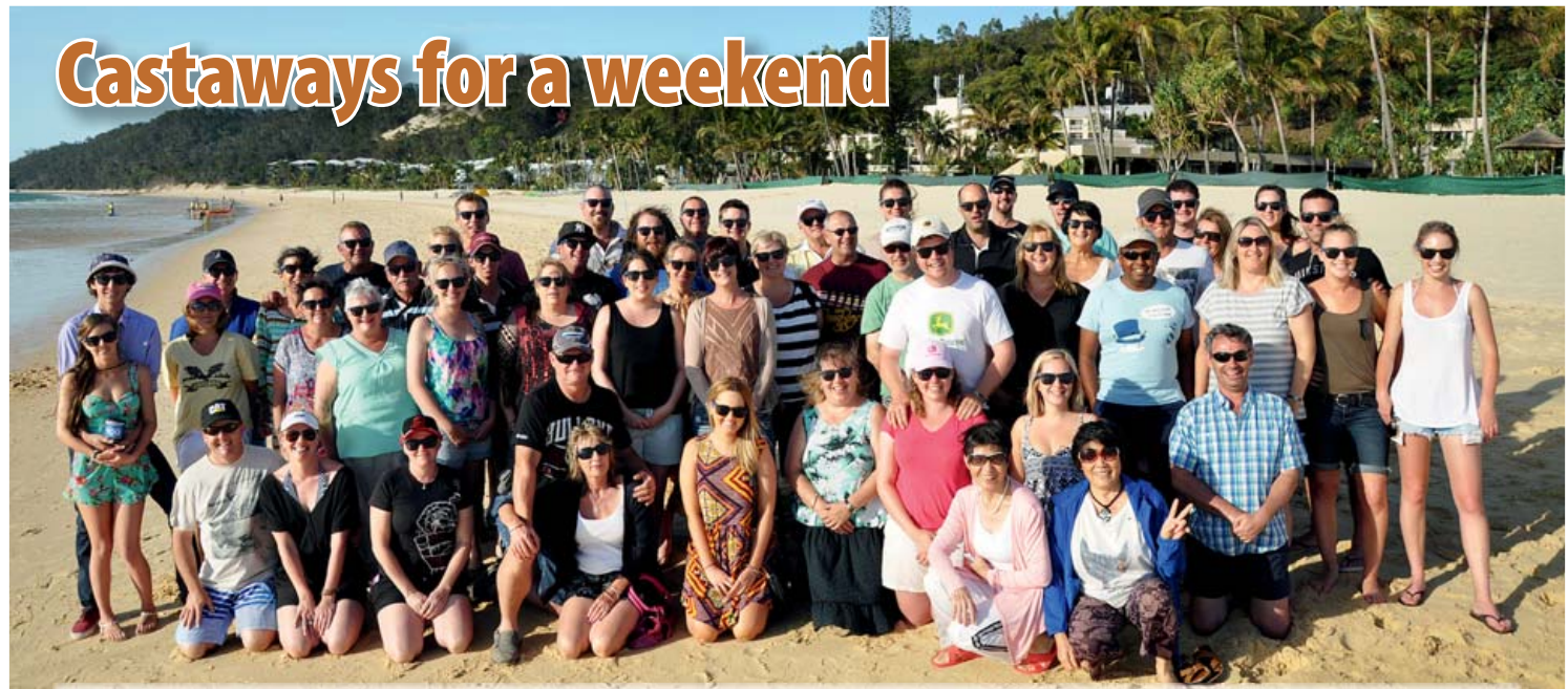
HUTCHIES' Toowoomba social club recently invaded Tangalooma resort on Moreton Island for a weekend of fun and frivolity. Beach cricket, swimming, sand tobogganing, sunset cruise, dolphin feeding, wining and dining and karaoke were just some of the activities that took place!