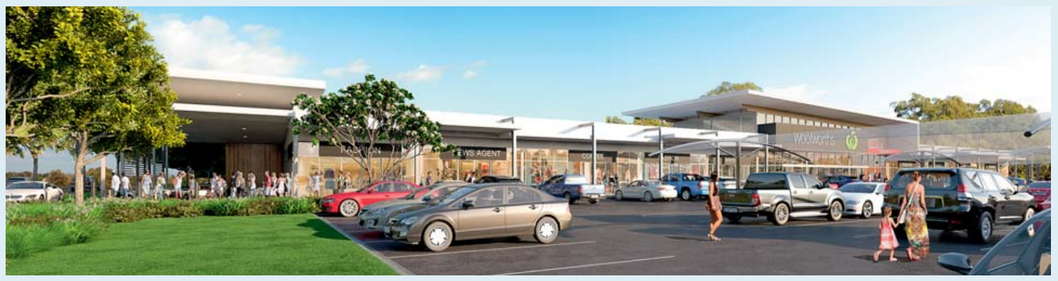
Artist's impression of the new Woolworths and other associated retail outlets under construction in Bakewell, Northern Territory.

Job Description: Project is the design and construction of a new Woolworths store and nine associated specialties which includes provision of serviced building pads for future development of a new fuel station and McDonalds restaurant, and AC paved car parking and ridge steel car park shade structures. Extensive external road works to service the completed facility to be carried out consisting