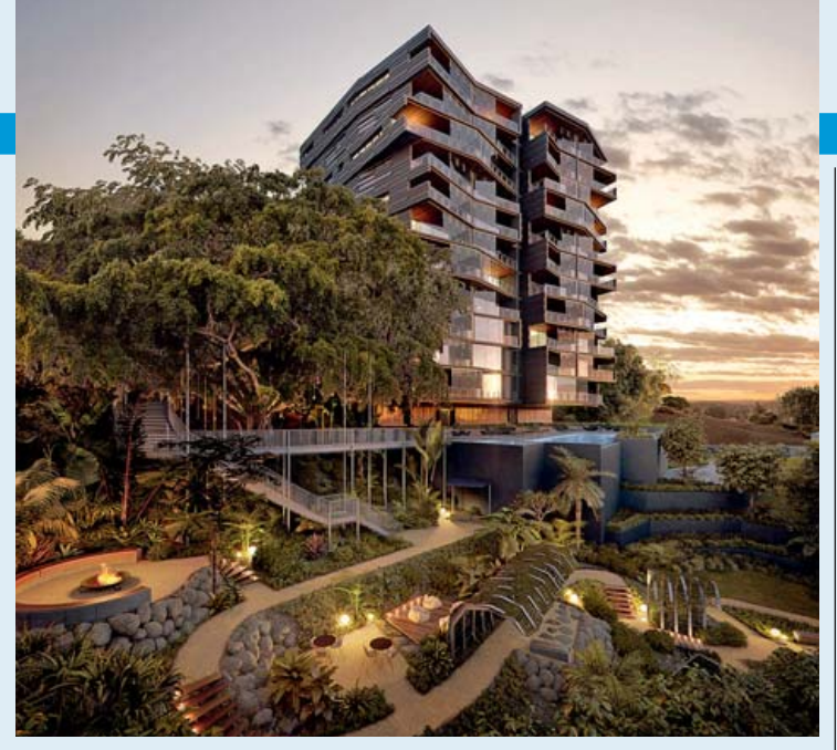
Artist's impression of The Highgate. Site work involves protection and working around five protected fig trees.

of slip lanes, service diversions, bus stop and roundahout