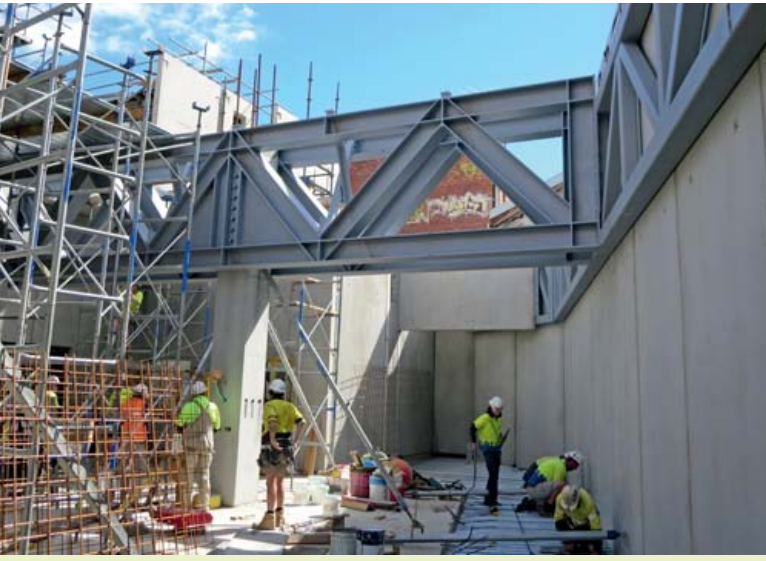
Floor trusses in place for the new Myer Hobart development.

Board members also visited the Toowoomba office to introduce themselves and chat with local team members.