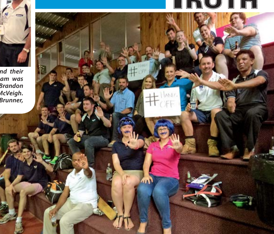
Team members and spectators at Hutchies versus RMA annual Indoor Cricket Challenge showed their support for the Hands Off campaign.

The annual cricket match was staged at the Toowoomba Indoor Sports Centre in November.